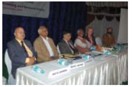
The valedictory session