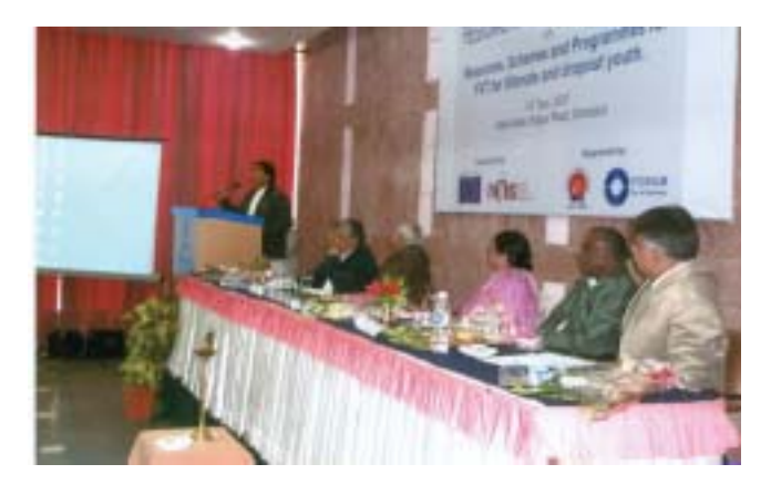
A one-line caption to come here